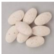
Tablets Packaged with PharmaKeep®

Degradation avoidance: With PharmaKeep, the chemical and physical degradation of drug products can be mitigated, sometimes visible in extreme color change, especially with uncoated tablets.