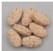
Tablets Packaged without PharmaKeep®

Oxidative degradation, as well as moisture, is a major pathway for degradation of pharmaceuticals, probiotics and other healthcare products during production, isolation processes and storage.