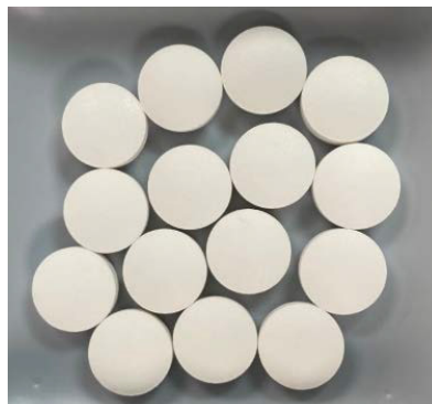
Figure 2: pH-Independent Drug Release of Coated Caffeine tablets