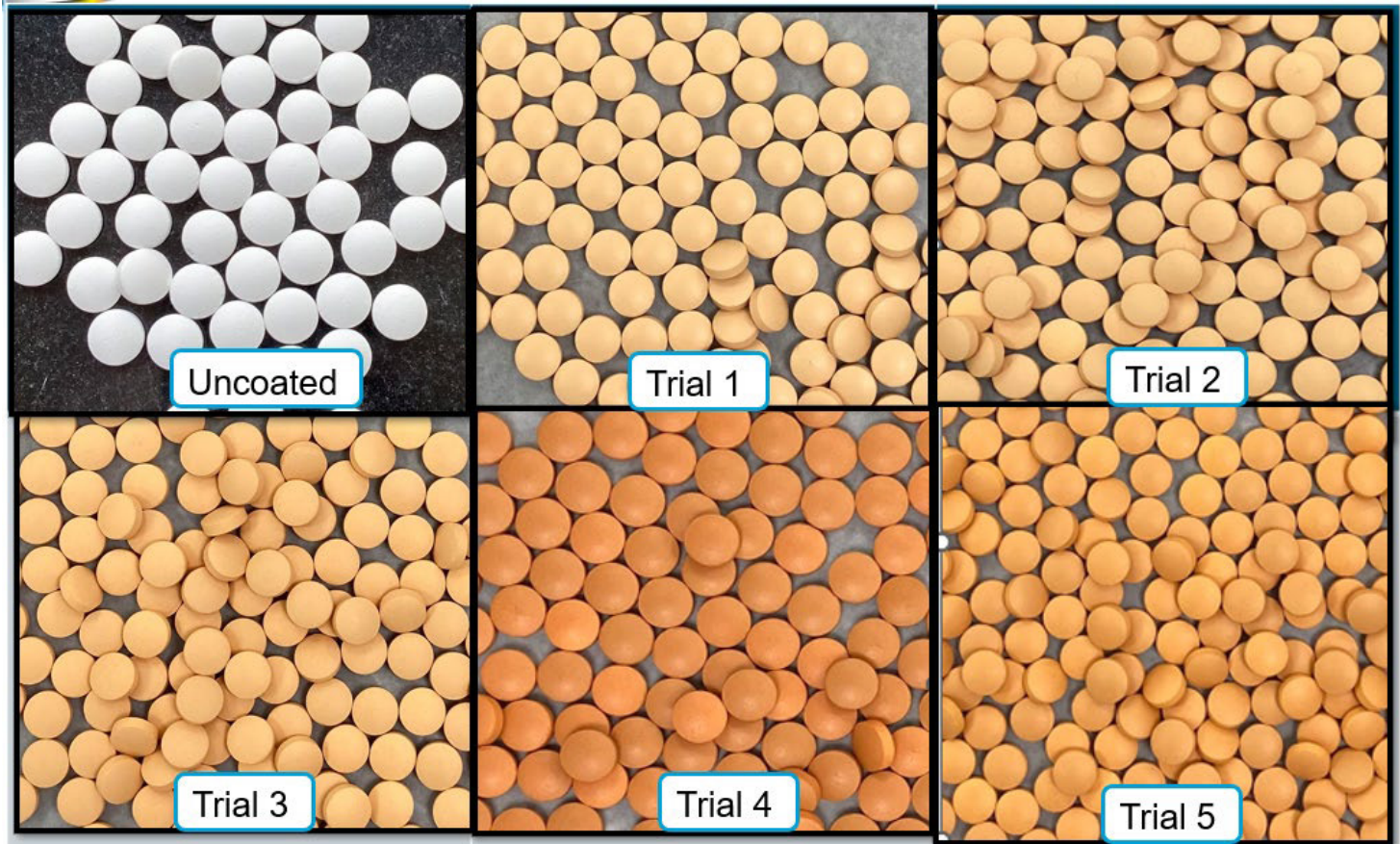
Figure 1: Surface Appearance for Uncoated vs Film Coated Tablets

Assay, Impurity Testing and Dissolution Testing for Sitagliptin: The sitagliptin content of the uncoated and film coated tablets (Trials 1-5) was within acceptable limits of 95-105% at both the initial and end of 3M accelerated stability storage (Figure 2). Impurity profile was NMT 0.2% (limit is 1%) up to 3M upon stability storage for all film coated tablets, indicating Opadry TF film coating system did not result in drug degradation. No significant difference in drug release was observed for all the film coated tablets at initial and accelerated stability conditions of 40°C/75% RH (Figure 3).