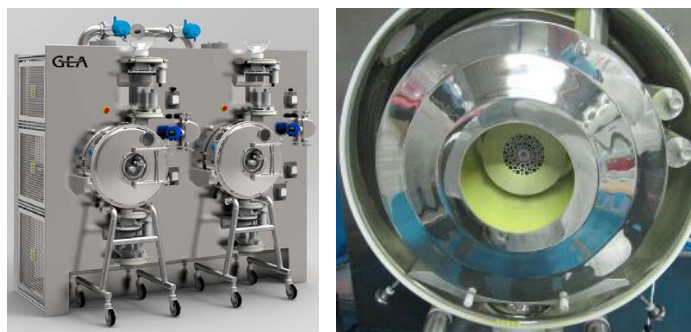
Figure 2. GEA ConsiGma Coater

Through more than 20 coating process trials using Opadry QX at 20-35% w/w solids, the residence times per 3 kg pan load averaged 5-10 minutes, potentially eliminating any bottlenecks in the continuous process train (blending, granulation, and tableting). All tablets were defect-free, uniformly coated and of good overall appearance (6).