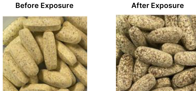
Figure 2. Color Difference (DE) for Tagged and Untagged APAP Tablets Following Storage for 6 Months at 40°C/75% RH